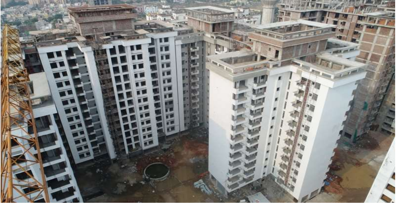
BIRD EYE VIEW OF BLOCKS A01, B04, B05, C13

IN BLOCK C14 – 100% CASTING WORK COMPLETED. IN BLOCK C13- 100% CASTING WORK COMPLETED. IN BLOCK A01- ABOVE OH TANK PARASOL CASTING WORK IN PROGRESS.